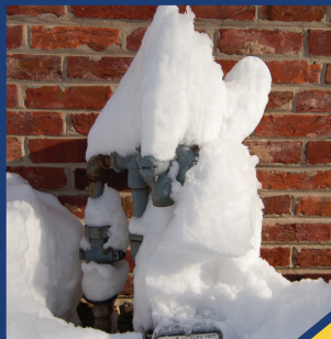
METER WITHOUT SNOW SHELTER

For more information about natural gas safety, visit www.swgas.com/safety or call 877-860-6020.