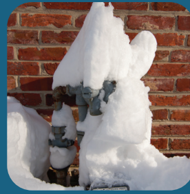
METER WITHOUT SNOW SHELTER