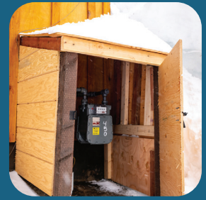
METER WITH SNOW SHELTER

Heavy snow and ice falling from roofs can damage natural gas meters, regulators, and associated natural gas piping. Special care must be taken when clearing roofs to prevent impact. Also, ice and snow accumulation, whether natural or manmade, can damage gas meters and outdoor appliances and create a hazardous leak.