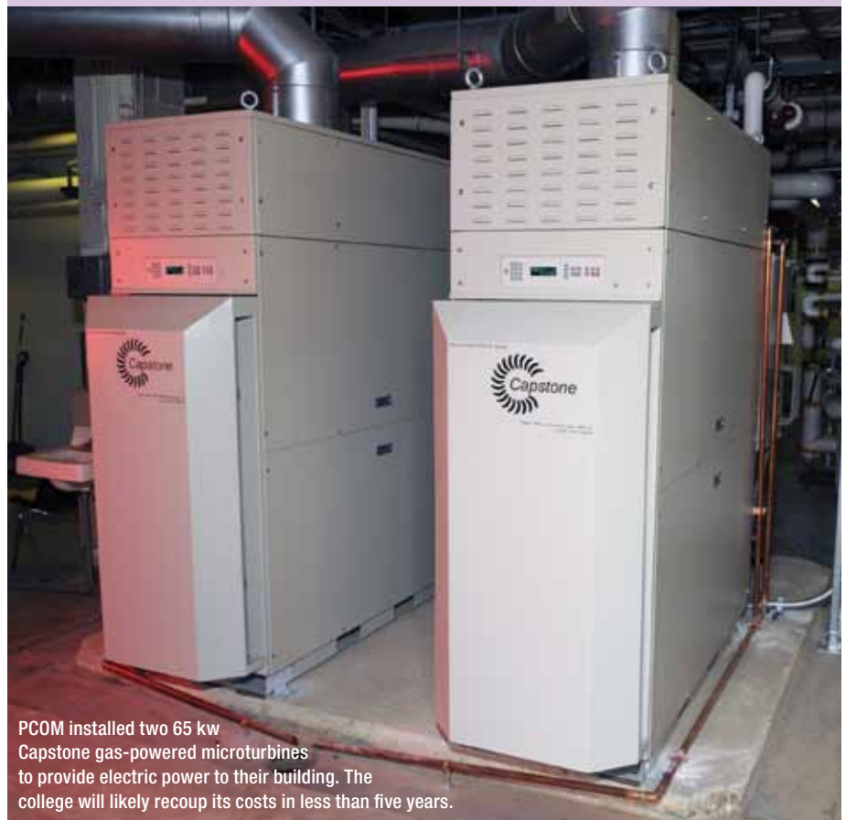
PCOM installed two 65 kw Capstone gas-powered microturbines to provide electric power to their building. The college will likely recoup its costs in less than five years.

The school is testing the microturbines in a single building, and if results continue to be favorable, the college plans to expand the use of microturbines to other campus facilities, says Windle.