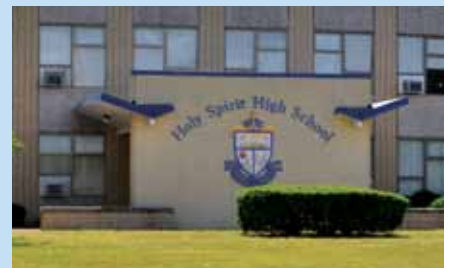
Holy Spirit High School in Absecon, New Jersey, has a more efficient and less costly heat system thanks to new high-efficiency gas heat system.

And the system works better, too. Individual room thermostats can be set to achieve more comfortable and consistent temperatures throughout the building, making everyone at the school happier.