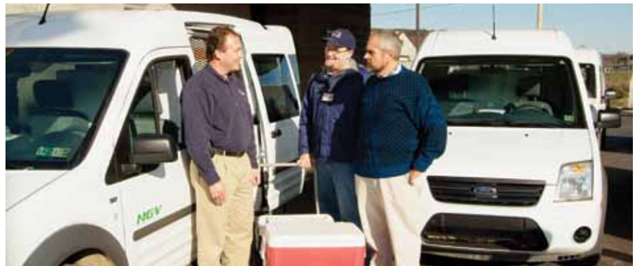
The Clearfield County Area Agency on Aging in Clearfield, Pennsylvania, added 11 natural gas-fueled cargo vans to its fleet.

Fueled by natural gas, it extracts heat from the surrounding environment, implements traditional boiler technology and combines it with an engine-driven heat pump to cut fuel consumption and carbon emissions in half. Free waste heat from the engine is captured and used, which adds to the capacity and efficiency of the unit.