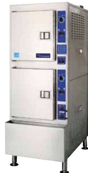
Cleveland Gemini steamer