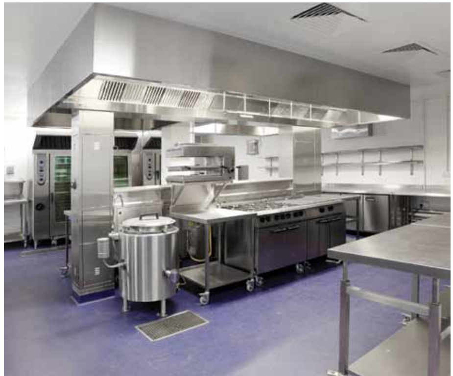
New technology is creating high-tech foodservice options that can save on operating costs and pay for themselves very quickly.

Demand control ventilation allows users to vary the speed of the hood de-