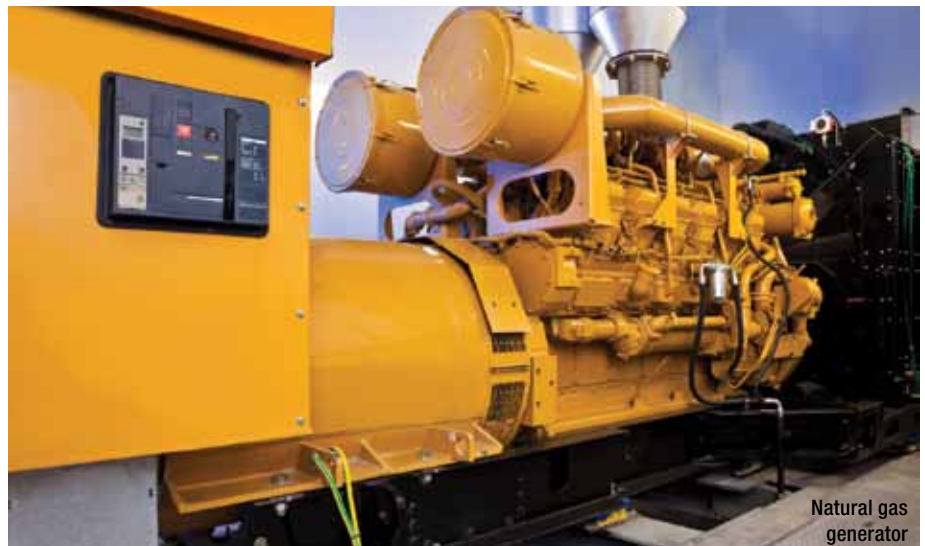
Natural gas generator

The Environmental Protection Agency (EPA) notes that natural gas fueled turbines are one of the cleanest methods of generating electricity with emissions of nitrogen from some large turbines in the single digit parts per million range. The EPA also states that, "Because of their relatively high efficiency and reliance on natural gas as the primary fuel, gas turbines emit substantially less carbon dioxide (CO 2 ) per kilowatt-hour (kWh) generated than any other fossil technology in general commercial use."