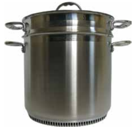
Eneron Turbo pot