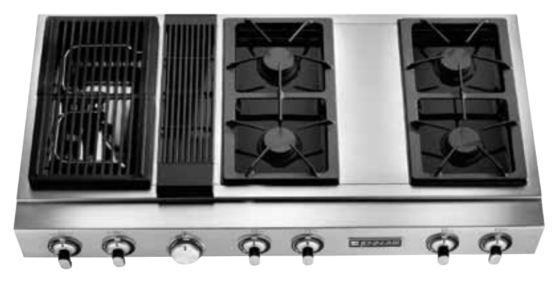
Jenn-Air's modular downdraft cooktop brings the grilling experience inside.

"The future of kitchens is in the integration of elements," says renowned architect and designer Campion Platt. "Virtually all the equipment can be hidden, thus the room can be transformed more to a living than just a function space. More people are opting for eat-in kitchens and also combining kitchen rooms with family rooms. Accordingly, the design of kitchens will become less functional looking and more appealing as an interior room, more connected to the rest of the house."