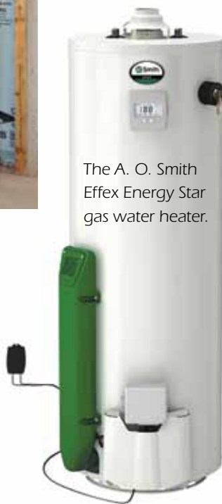
The A. O. Smith Effex Energy Star gas water heater.

Many existing water heaters are vented through the roof to the outside — this is called atmospheric or conventional venting. Replacing an older atmospheric unit with a newer, more efficient unit is typically an easier installation. And now there are reasonably priced, highly-efficient atmospheric water heaters that are ENERGY STAR® rated and have a plug and play feature — like A. O. Smith’s Effex® gas water heater.