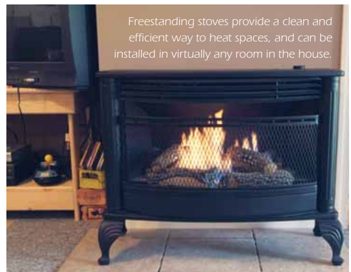
Freestanding stoves provide a clean and efficient way to heat spaces, and can be installed in virtually any room in the house.

These gas stoves burn clean energy and provide an efficient way to heat large spaces. In addition to being practical, the steel or cast iron stoves also come in a variety of styles and colors, which means they can be selected to complement the look and feel of whatever room it is needed in.