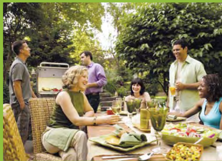
Trends in grilling like cooking with a plank and using grilling baskets add a new twist to the backyard barbecue.