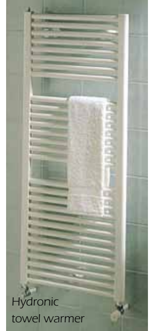
Hydronic towel warmer

Gas space heaters provide the perfect solution for heating small spaces.