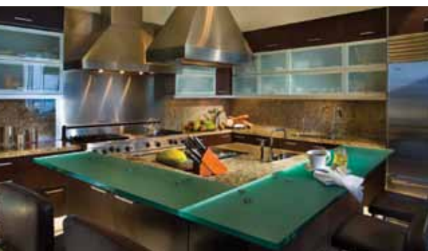
Contemporary design in a luxury condominium designed by Michael Wolk is complete with glass-faced cabinets and stainless steel appliances.

Cooking options are just as interesting as the appliance designs. Interest in pre-packaged foods is waning as cooking becomes as much a