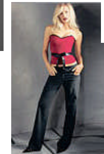
Strapless or mid-drift length shirts