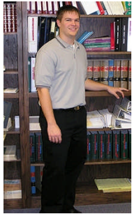
Polo shirt with khakis