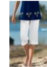
Pedal Pushers or Bermuda Shorts