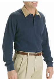
Slacks and collared shirt