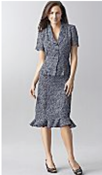
Skirt & blouse