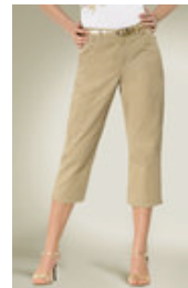
Pedal Pushers, Bermuda Shorts, or Capris