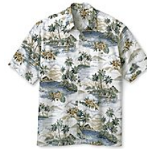
Men's Hawaiian shirt