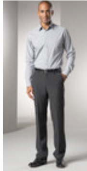
Shirt & dress pants