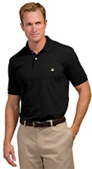
Dockers and collared/polo shirt w/small logo