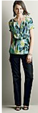
Blouse & dress pants